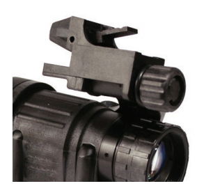
Helmet Mount Adapter Interface between PVS-14A monocular and head/ helmet mounts.