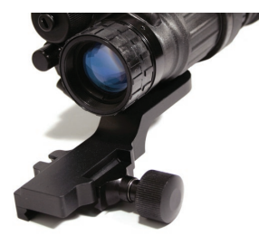
Weapon Mount Mounts to a variety of small arms weapons, in conjunction with the Picatinny rail.