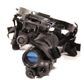
Head Mount Assembly Allows the PVS-14A to be used hands-free if a helmet is not needed.